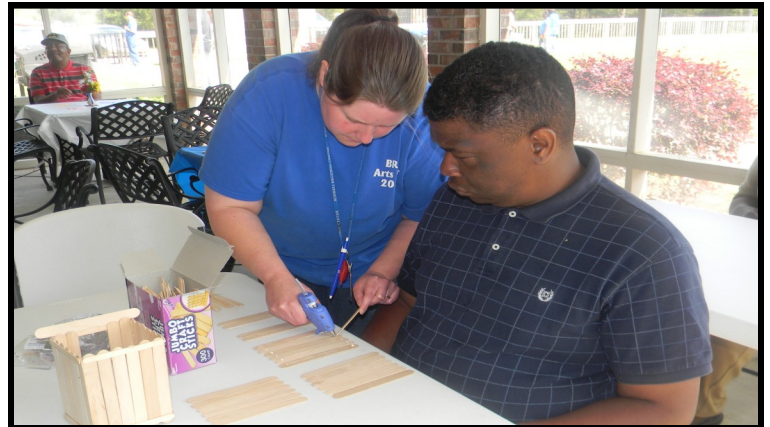
Participants playing games and making a few crafts during Autism Day at Morton Group Home.