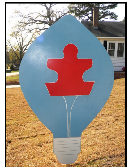
One of the Light it Up Blue light bulbs found around BRC campuses during Autism Awareness Month.