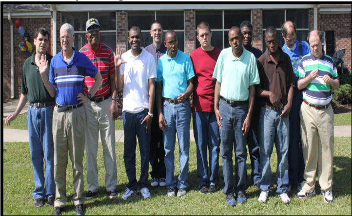
Morton and Goodwater Group Home residents celebrated Autism Awareness Day with games and a cookout.