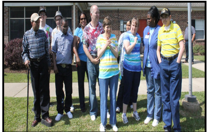
Residents and staff from the Brookhaven group homes traveled to Morton Group Home for the fun and games.