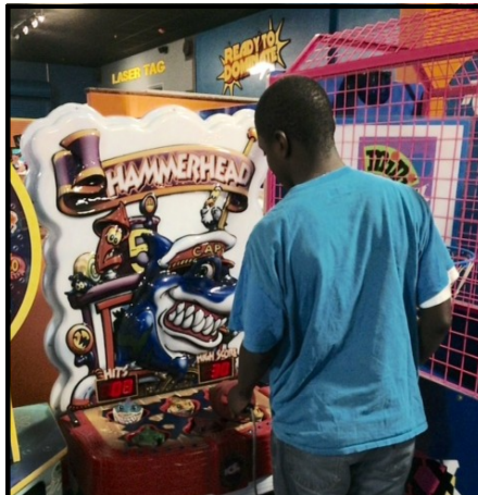
Some of the guys from the Mississippi Adolescent Center had a recent outing to Gatti Town, located in Hattiesburg, MS.