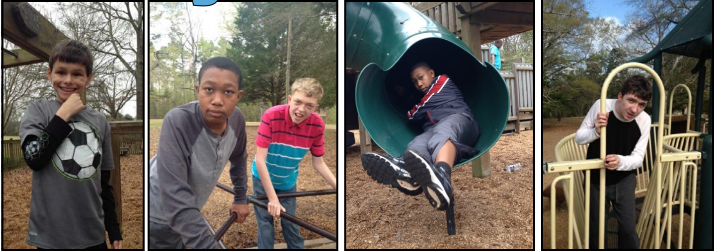
Here are some recent pictures of guys from the MAC when they had a day at a local Brookhaven park.