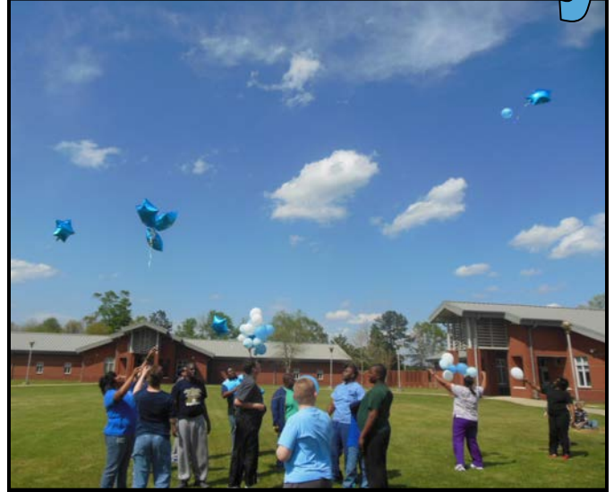
Mississippi Adolescent Center held an Autism Awareness Day on April 2nd. Everyone attending was given blue cupcakes and blue punch. There was also a balloon release that was enjoyed by all.