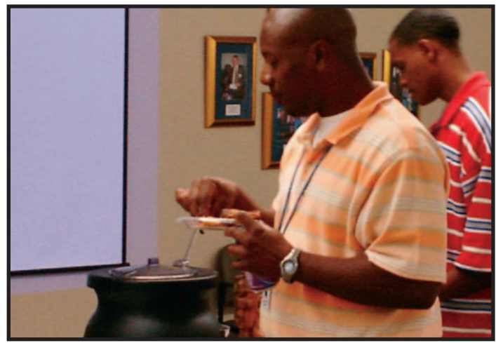
Red beans and rice originates in South America, but was definitely a Southern favorite with many Boswell employees.