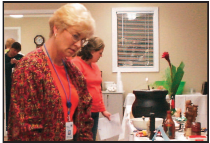
Employees learned interesting facts about ingredients contained in some of the native foods prepared.