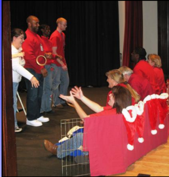
Above, Vocational Services entertained the crowd at the Christmas Show with their version of "The Twelve Days of Christmas."

Boswell is always a busy place during the holidays from parades to parties to the Christmas Show, "A Boswell Christmas" December's calendar was full.