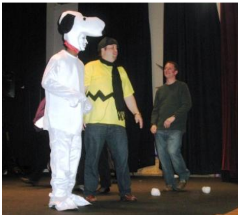
Good Grief...Charlie Brown!