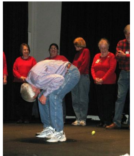
How many eggs?