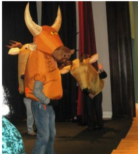
No bull...reindeer win!