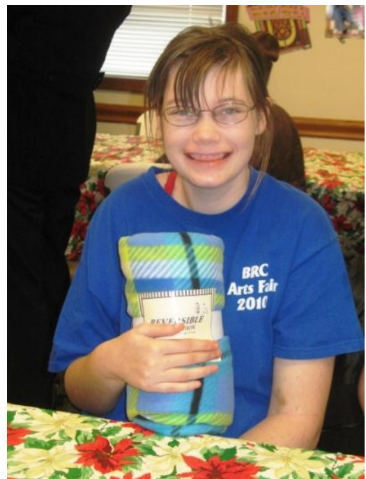
An individual from Unit 2 is pictured showing her present from Westminister.