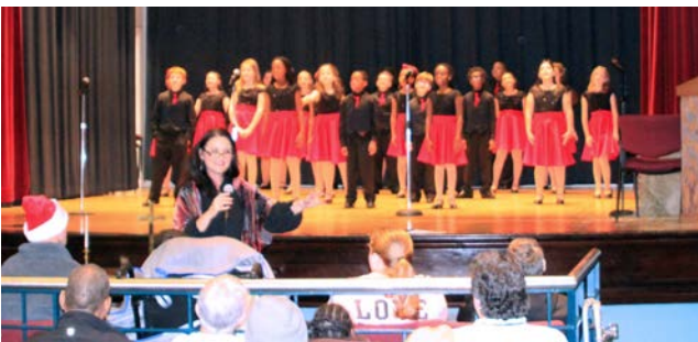
Magee Elementary Show Choir returned to Boswell by popular demand after their enjoyable program last year. Individuals were encouraged to sing along to many songs performed by the talented students.