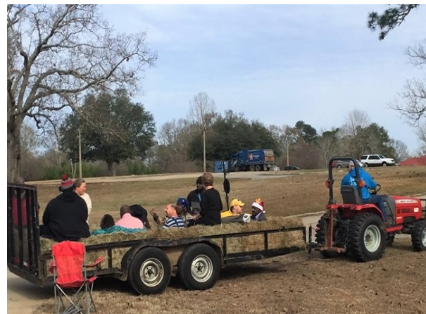
Individuals and staff enjoyed a hayride after an afternoon of caroling, roasting marshmallows and other fun activities organized by Recreation to celebrate the Christmas season.