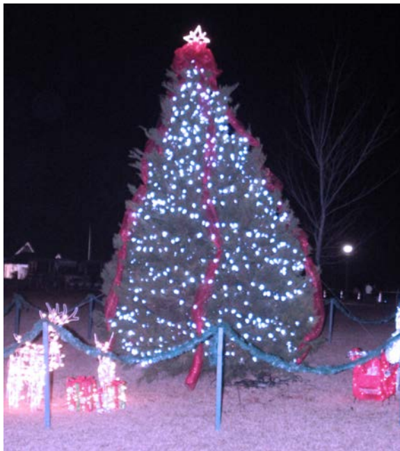
Boswell's Christmas tree was placed near the front gates for the enjoyment of everyone during the holidays. A tree-lighting ceremony heralded the beginning of the Christmas season.

Here are a few scenes from what turned into a very enjoyable Christmas season!