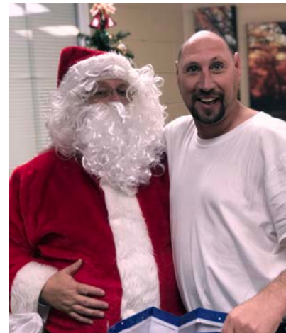
Santa made appearances at campus units during Christmas parties highlighted by special meals and music