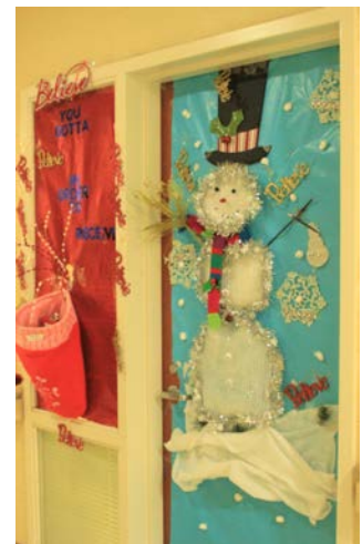
Each campus unit was decorated with festive Christmas décor to make the holidays brighter for those who reside in the units.