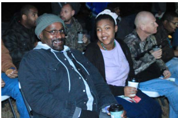
Sipping hot chocolate and enjoying sugar cookies served by staff was the icing on the cake at the Christmas tree lighting.