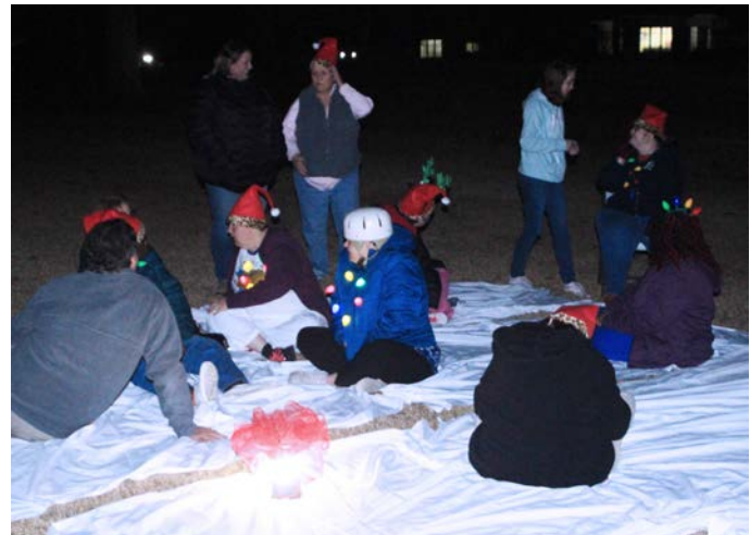
Campus individuals enjoyed listening to Christmas carols and visiting with friends as they awaited the lighting of the Christmas tree.