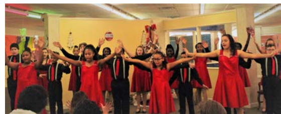
Members of Magee Middle School's Show Choir visited Dream Extreme before Christmas and performed for the enjoyment of community individuals and staff.

A heartfelt thanks to everyone that helped make Christmas "merry" for Boswell's individuals, including: