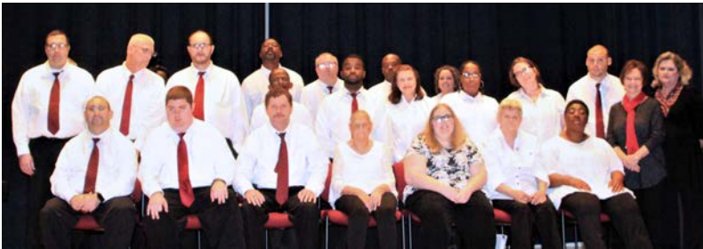
Boswell's choir performed a Christmas program for the entire campus. Choir members had worked long and hard to perfect the program filled with hymns and classics.

Christmas programs filled with sacred hymns and familiar carols and songs are a special part of the season to which Boswell's individuals look forward every year. Show choirs from Magee Elementary School and Magee Middle School came in to present special programs at which individuals were invited to sing along. Just before Christmas, Boswell's choir performed for the entire campus, presenting a program for which they had been practicing for months. Finally, Christmas caroling around campus to various departments and building was enjoyed by individuals, topped off by cooking s'mores around a fire and a hayride.