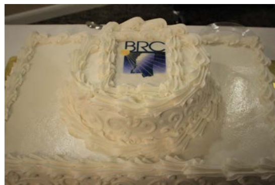
The last "Boswell cake" of 2019 and the decade was served at the December employee recognition and retirement reception. The cake is served at all official functions throughout the year.