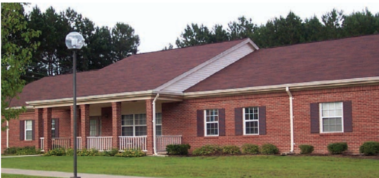
Pictured is one of the two Taylorville group homes that are now part of Boswell. Two other homes are located in Bay Springs.

On July 1, four Ellisville State School group homes were transferred to Boswell Regional Center and are now operated under the center's operations. Two of the group homes are located in Bay Springs and two are in Taylorville.