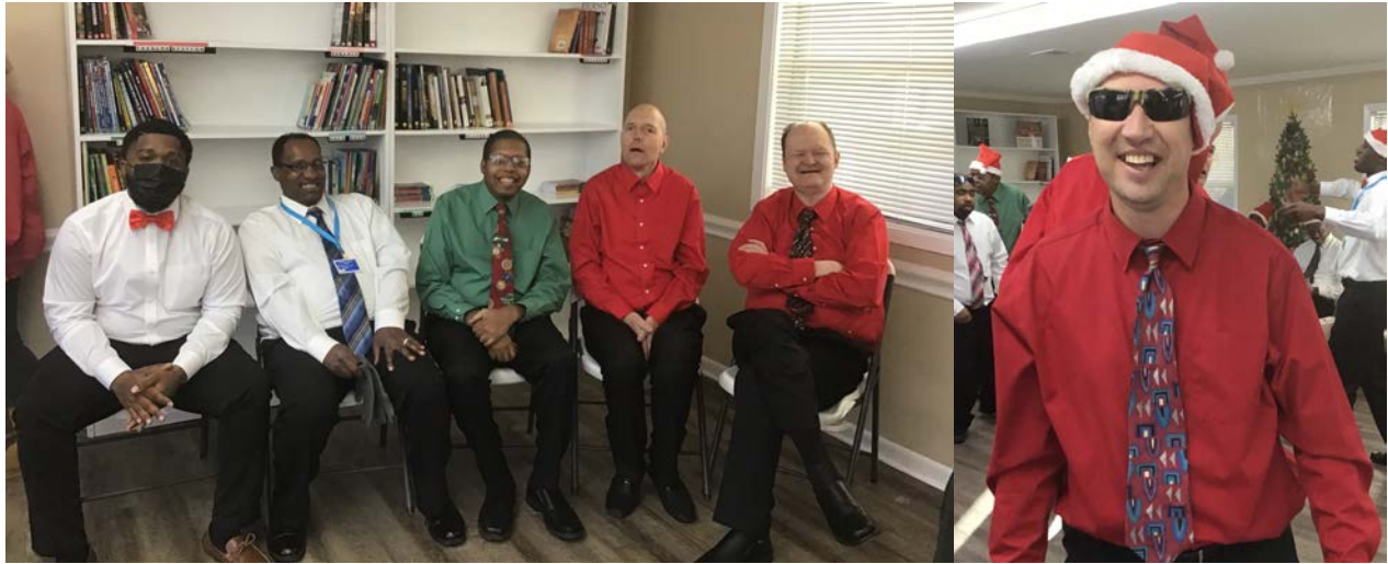
Ridgeview's guys looked sharp at their party, dressing up in their dress shirts and ties.