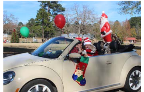
Family members decorated their vehicles and drove through campus to wave to their loved ones.