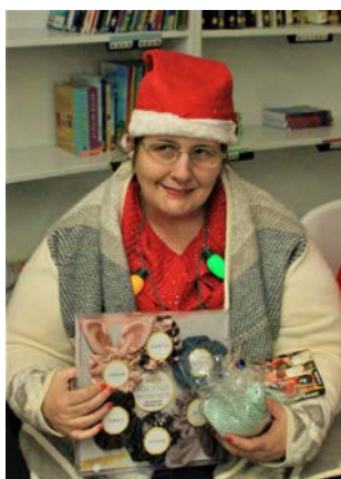
Hair care items delighted this lady that resides at Oakbrook.