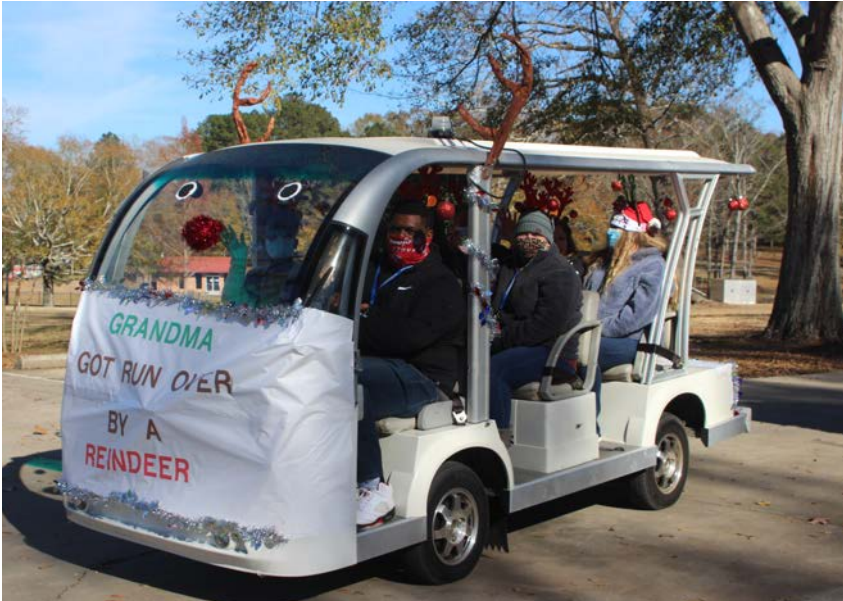
Recreation organized the parade and then decorated a Starcart so all rec therapists could ride through and wave at individuals in front of their buildings.

Reviving a popular event of the past, a Christmas parade through campus was held the week prior to Christmas. Staff, community supporters and family members participated this year, setting the stage for an annual event.