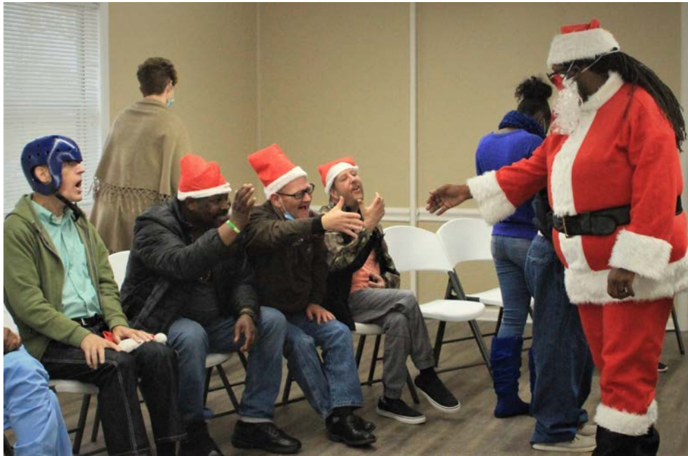
Santa also made an appearance at Fairway's party, much to the delight of the guys.