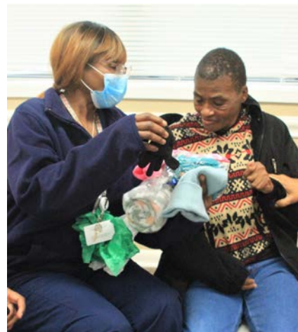
Warm hats, socks and gloves were just some of the gifts delivered by Westminster Church in Hattiesburg and presented to ladies at Oakbrook's party.