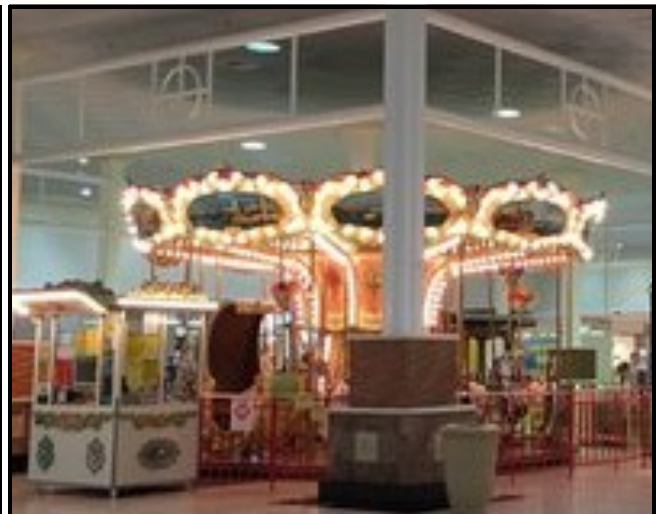
The carousel inside Edgewater Mall in Biloxi, Mississippi