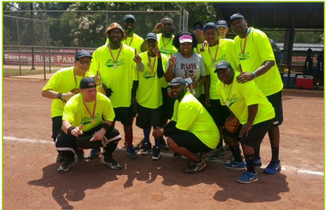
The Boswell Badboys won the gold medal in Division I Special Olympics MS State Softball Games on Saturday, June 25 th . The following athletes, unified partners and coaches participated: