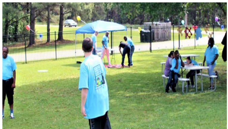
Individuals and staff enjoyed getting outside and playing games and just enjoying the nice weather during Autism Day.