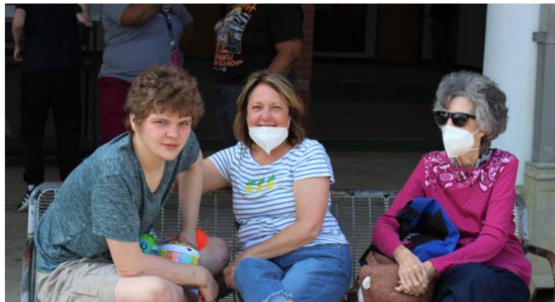
Family members enjoyed spending time with their loved ones at the MAC. Lunch was provided by Friends and Family.