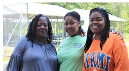
Left, staff enjoyed playing games and simply hanging out and socializing during the picnic.