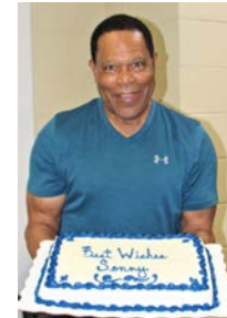
Sonny's big smile and easy-going personality will be missed by the individuals and staff.