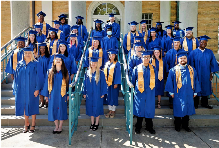
2022 graduates of CLCC's Simpson Center gathered on the front steps of the Auditorium for a group photo. College officials and guests were quick to compliment the professional landscaping work of Boswell's Grounds Maintenance team.

Boswell's historic Auditorium was chosen by Copiah-Lincoln Community College's Simpson County Center as the site for its Spring Commencement in May. Boswell's maintenance department went to work power-washing, carpet and floor cleaning, landscaping and repairing minor issues to ensure the building was refreshed and ready for visitors. The center's LPN students will receive their pins at a graduation ceremony to be held in the Auditorium in July.