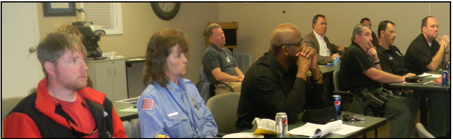
Local law enforcement was invited to a Lunch and Learn presentation to hear the direction we are heading at Boswell Regional Center. There were presenters that spoke on The Community Services Programs, the location of each site, the different characteristics and diagnoses of Mental Disorders in persons with Intellectual disabilities and finally what our Crisis Intervention Team has to offer.