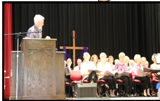
Senior group, Happiness Is, from Raleigh