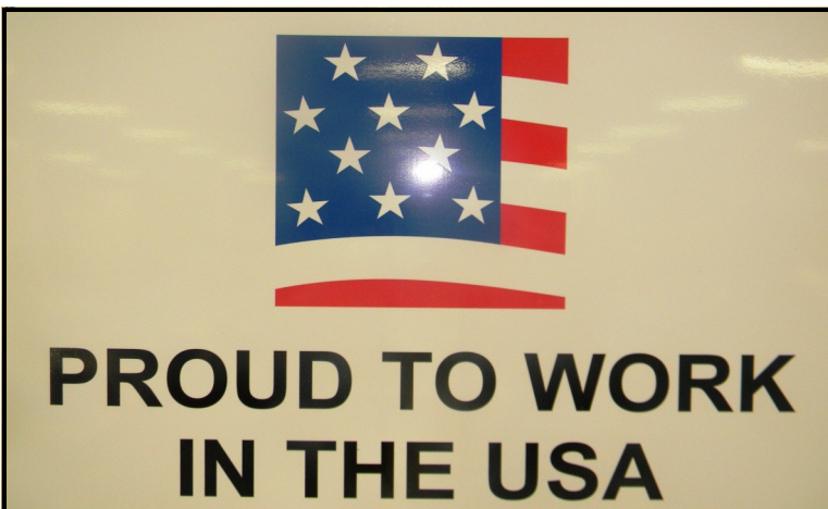
This sign proudly hangs on the wall at Boswell Industries in downtown Magee