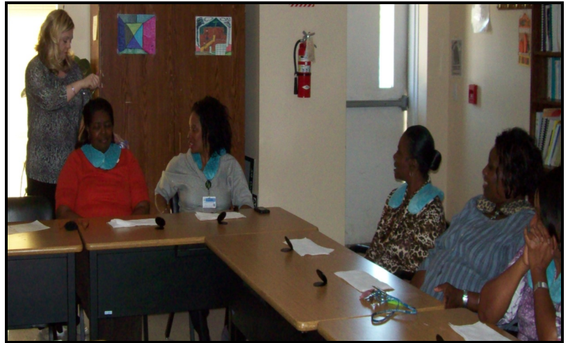
Boswell staff at the Brookhaven campus had their turn at an Employee Spa Day