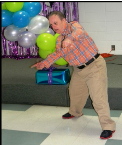
The Seniors of Pine Lake Geriatric and Prime Timers put on their dancing shoes and danced the night away!

Thanks to all who helped make the night a success.