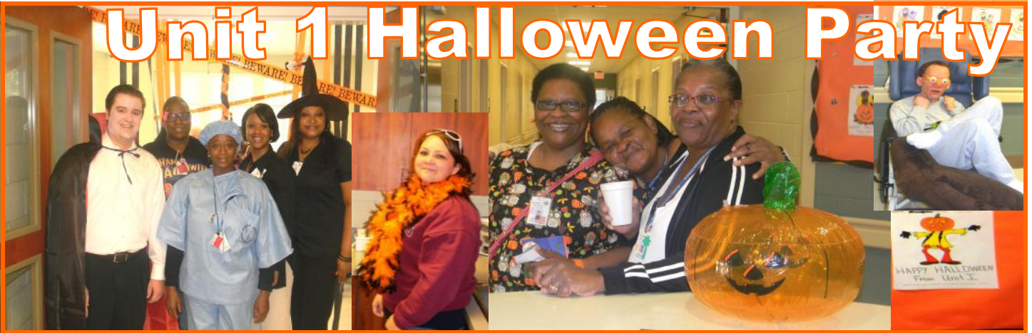
It was all treats and no tricks when Unit I had their Happening Halloween Party in October.