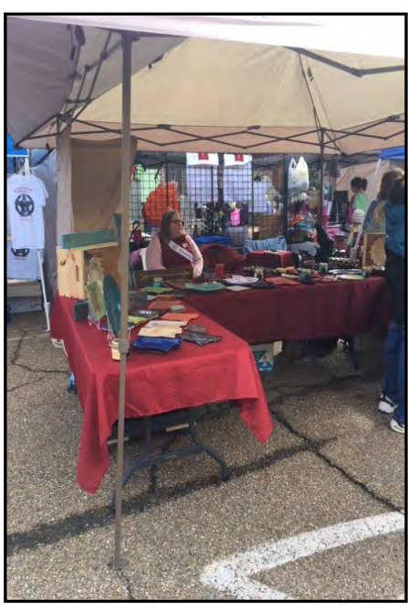
Vendor at Magee's Crazy Day