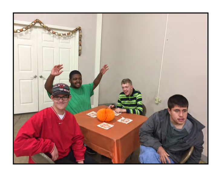
Dining as a family