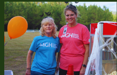
Magee General Hospital