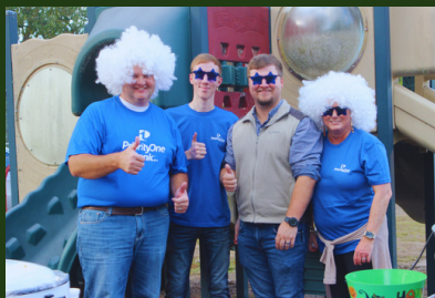
Priority One Bank