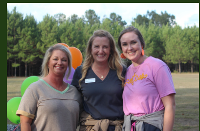
Vital Caring Group