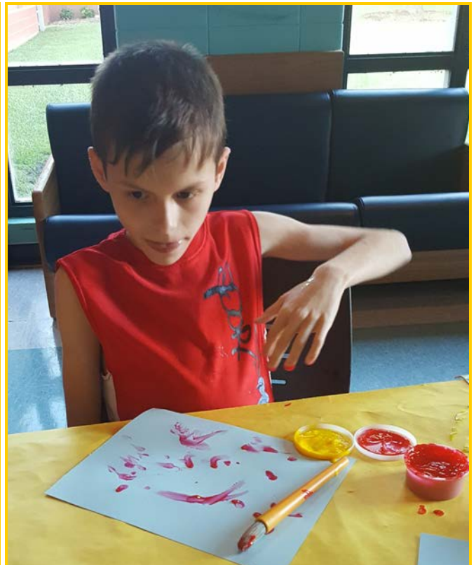
On Monday, September 19, 2016, a couple of the MAC students who live in Magnolia Dorm had arts and crafts during recreation time. They painted and finger painted pictures of their choice.