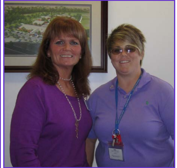
Employees at the Mississippi Adolescent Center dressed in purple in recognition of Alzheimer's awareness.