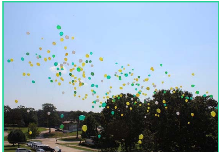
Boswell Regional Center Celebrated its 40th anniversary with a balloon release. The balloons were the original BRC colors when it was established in 1976.