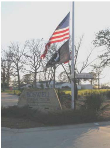
Boswell flags flew at half mast in honor of the late president Gerald R. Ford who was buried on Tuesday, January 2, 2007.